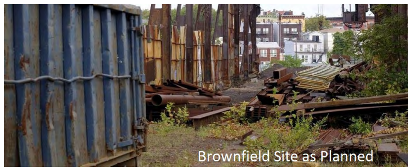
Brownfield Site as Planned